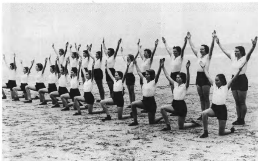
Gym on the beach at Newquay