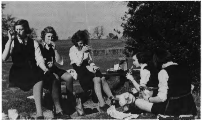
A School Holiday